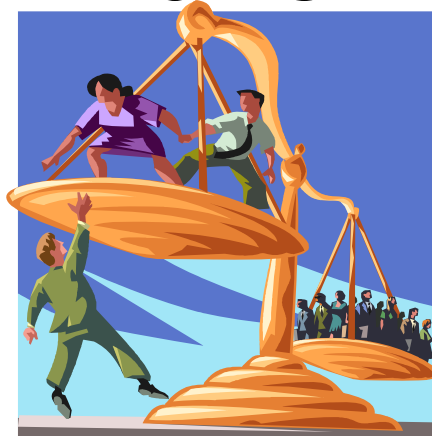
“Serving Our Diverse Population”

Counseling is an important component in the overall success of a student. The Special Populations Counselor provides personal, social, vocational, and academic counseling. The counselor is the main referral source for assisting instructors in making accommodations for individual student needs, as well as determining other support service needs.