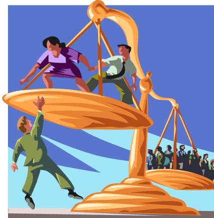
“Serving Our Diverse Population”

Fayetteville Technical Community College does not practice nor condone discrimination in any form against students, employees, or applicants on the ground of race, color, national origin, religion, sex, age, disability, or political affiliation.